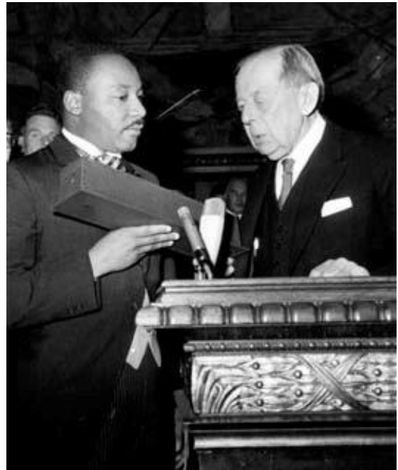
King receives Nobel Peace Price