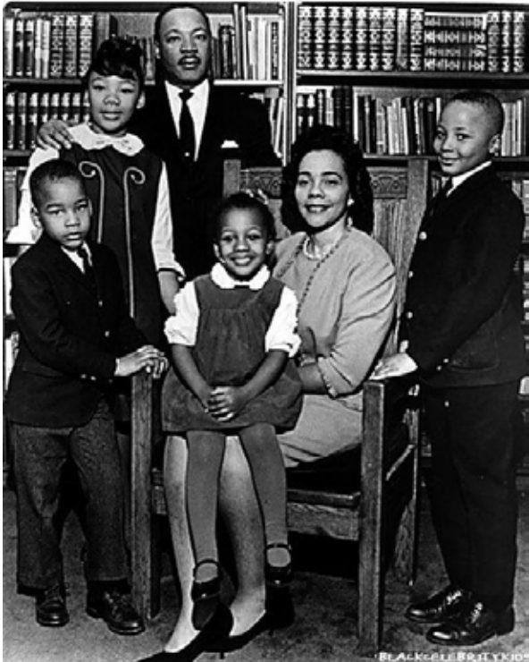
Wife Coretta Scott King; Clockwise: Martin Luther King III; Bernice Albertine King; Dexter Scott King; Yolanda Denise King and Martin.