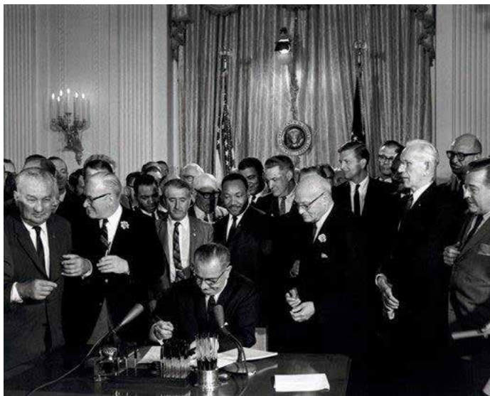
Martin Luther King, Jr. looks on as President Lyndon Johnson signs the Civil Rights Act of 1964 in the East Room. July 2, 1964.